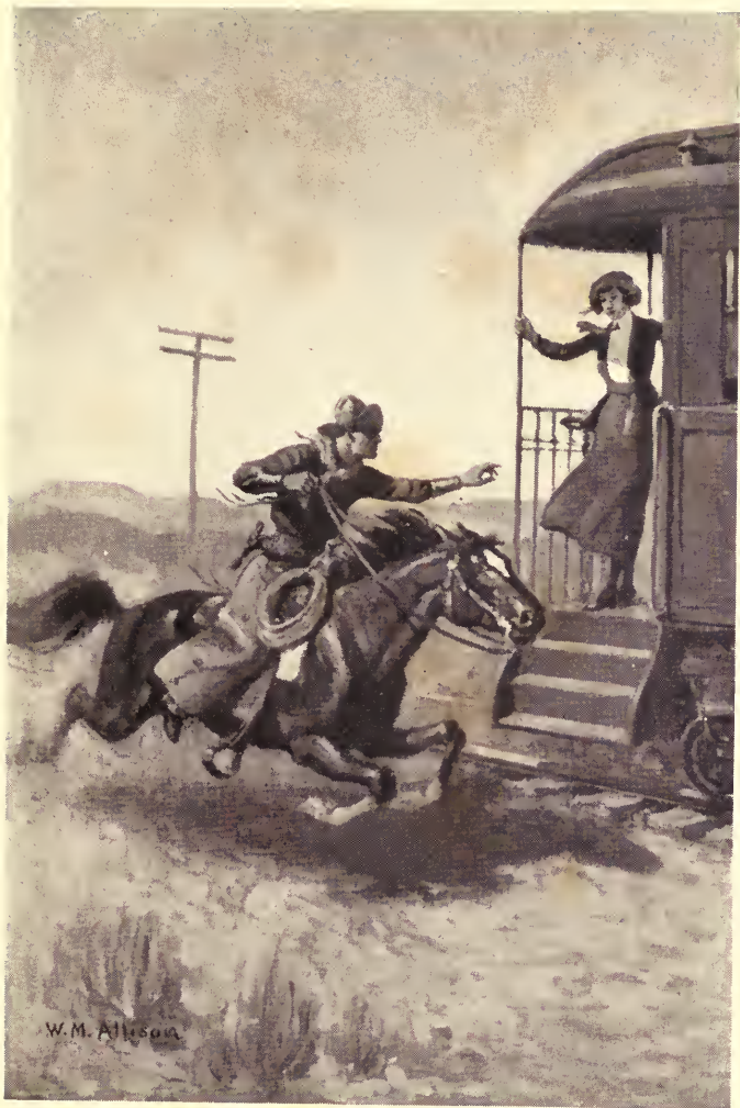
Twice the rider tentatively reached out